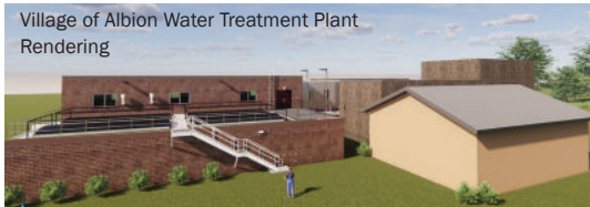
Village of Albion Water Treatment Plant Rendering