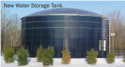
New Water Storage Tank