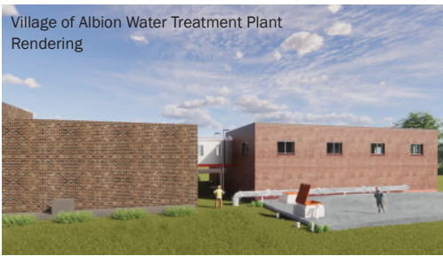
Village of Albion Water Treatment Plant Rendering