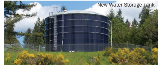
New Water Storage Tank