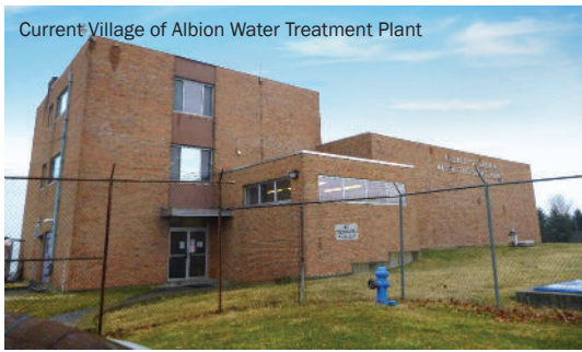
Current Village of Albion Water Treatment Plant